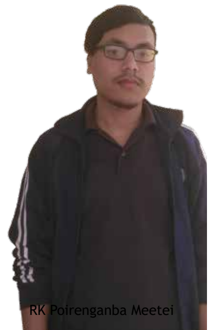
RK Poireinganba Meetei

Total electors: 20,395 Total male electors: 10,599 Total female electors: 9,785 Total transgender electors: 11