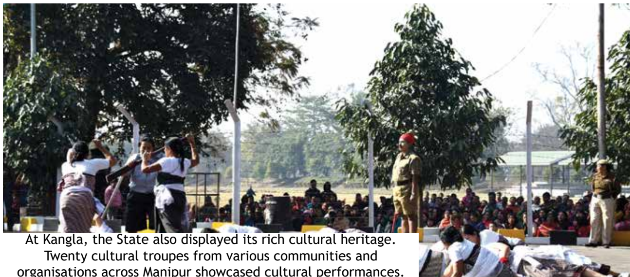
At Kangla, the State also displayed its rich cultural heritage. Twenty cultural troupes from various communities and organisations across Manipur showcased cultural performances.