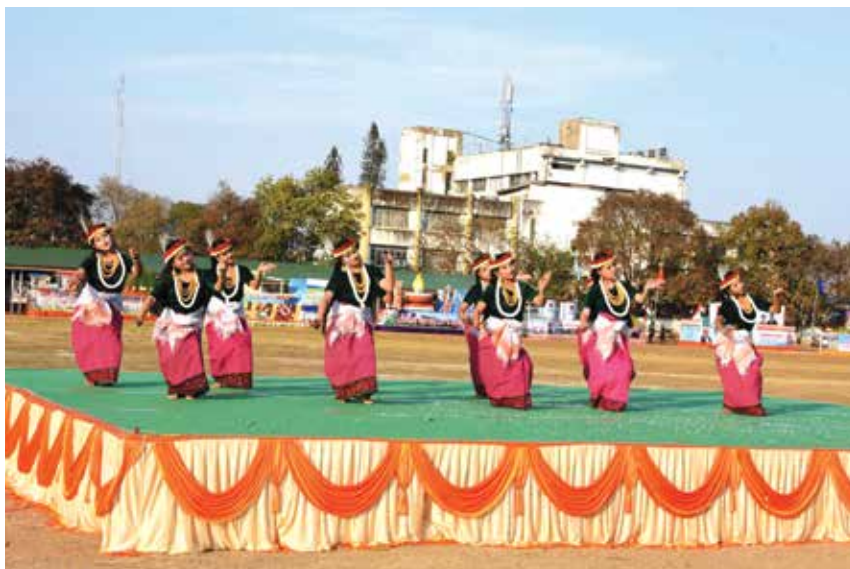
The 70th Republic Day celebration concluded with “Folk Dance Competition and Beating the Retreat ceremony” held at 1st Bn. Manipur Rifles parade ground on 27th January 2019.